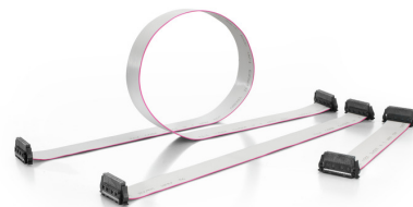
Three standard lengths (0.1 m, 0.2 m, and 0.5 m)