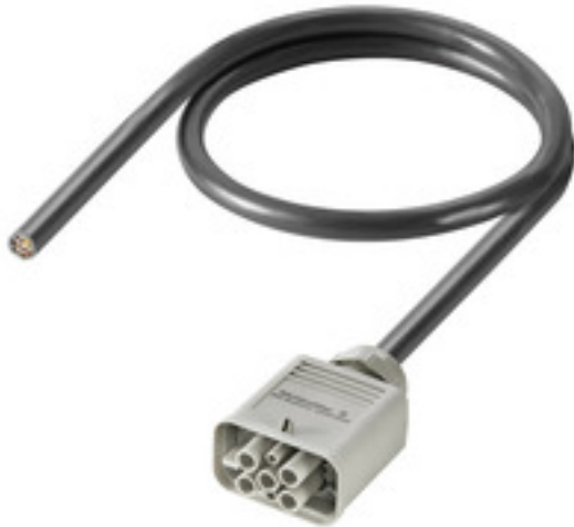
Product similar to illustration

The increasingly networked industrial world goes hand in hand with the modularization of machines and systems. Functions from the control cabinet are increasingly being moved to field level, which drives up the amount of cabling required.