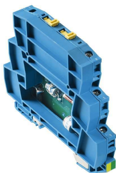
Similar to illustration