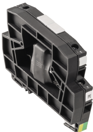
Similar to illustration