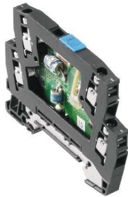
Similar to illustration