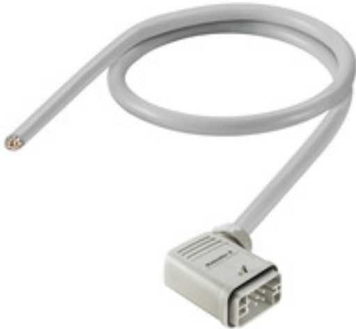
Product similar to illustration