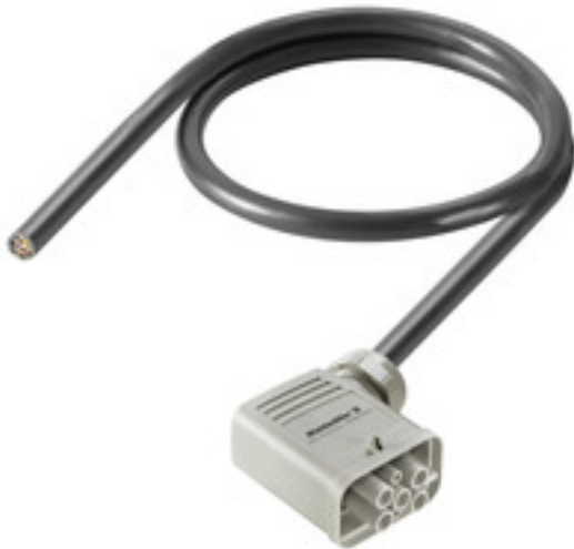
Product similar to illustration