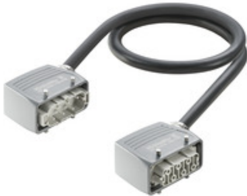
Product similar to illustration

The increasingly networked industrial world goes hand in hand with the modularization of machines and systems. Functions from the control cabinet are increasingly being moved to field level, which drives up the amount of cabling required.