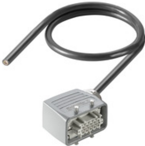
Product similar to illustration