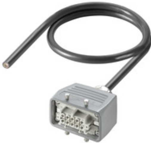
Product similar to illustration