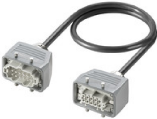
Product similar to illustration