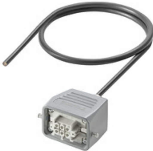
Product similar to the picture