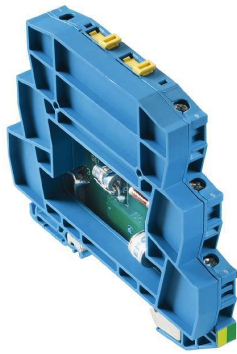
Similar to illustration