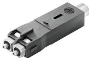
FO SC inserts for plug-in connectors ver.1 / 4 / 14