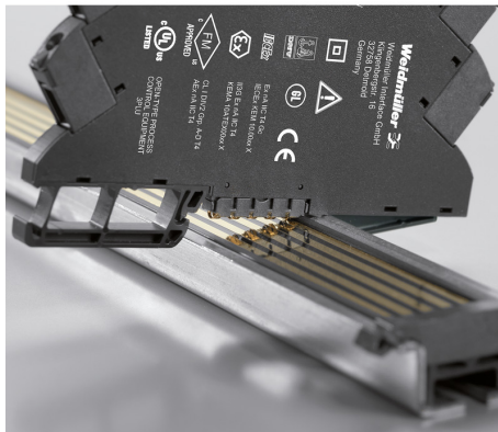
Power supply via the rail bus