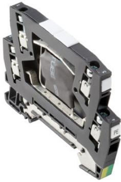
Similar to illustration