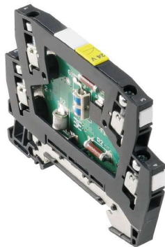
Similar to illustration