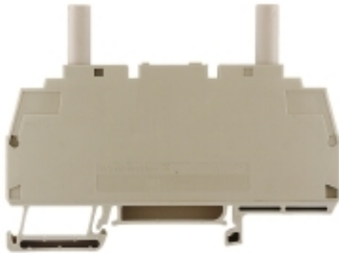
WTL 6/3/STB 101860