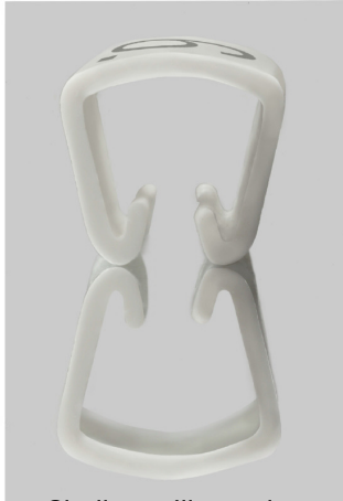
Similar to illustration